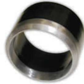
ECP Packer Cup