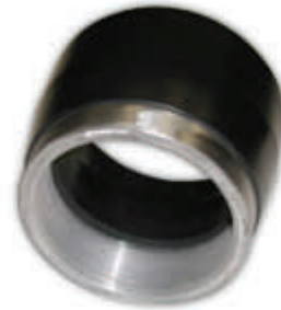
Surge Tool Cup